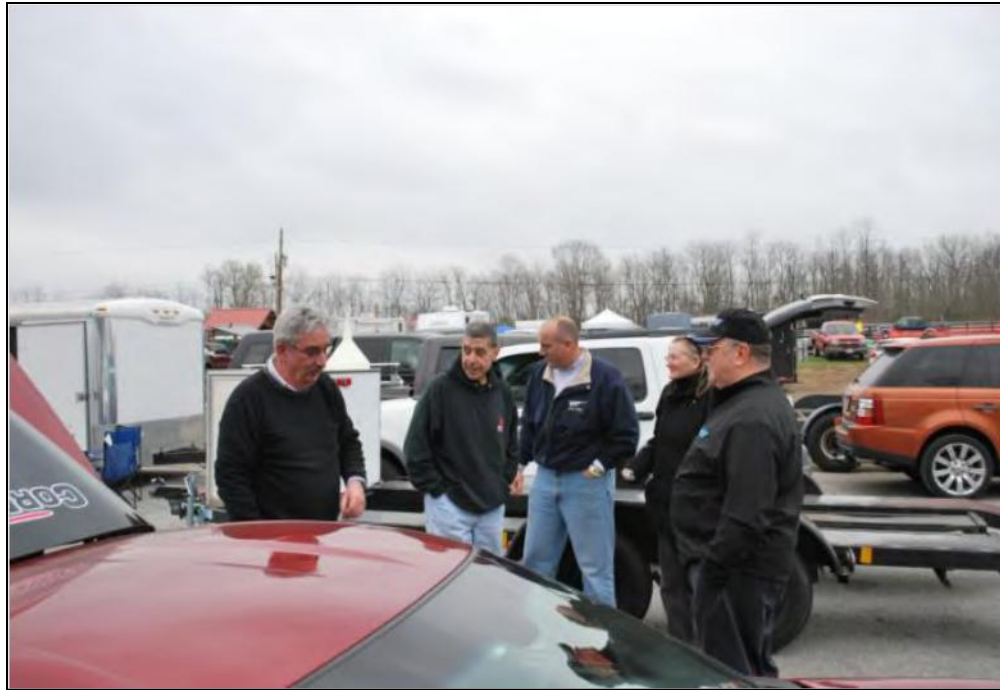
Racers at Summit Point Raceway getting ready to run.