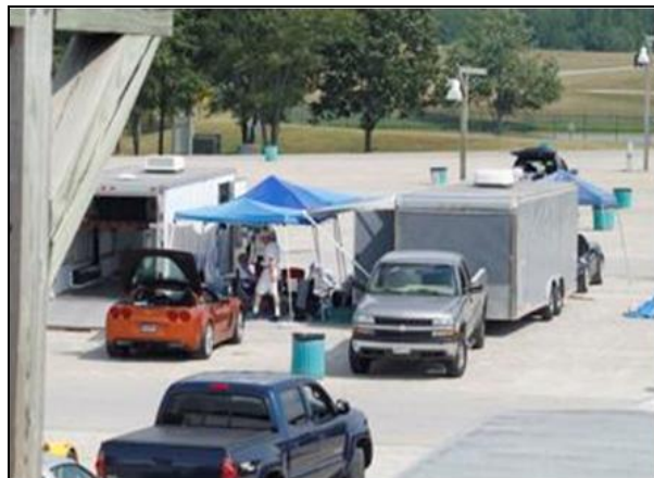
The CCA Compound at VIR