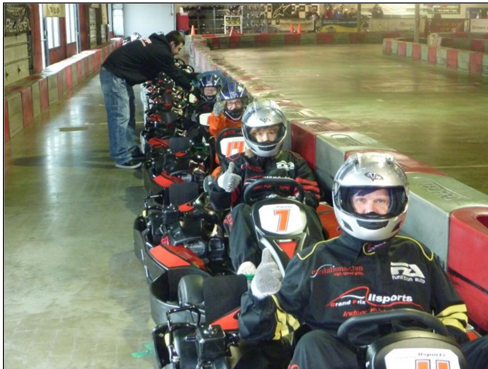
Arrive and Drive Group preparing to head out on the track at the Allsport Go-Kart event.

Here are a few photo reminders of all of the competition fun that we had in 2011.